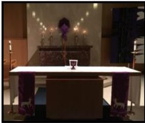
The altar is made ready for Eucharist in Lent.