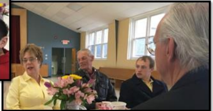
The Burnetts enjoy Easter Sunday's breakfast.