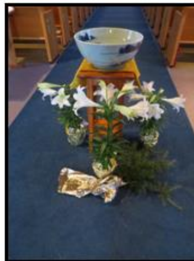
Waters from the Easter Vigil to mark the renewal of Baptismal Promises.