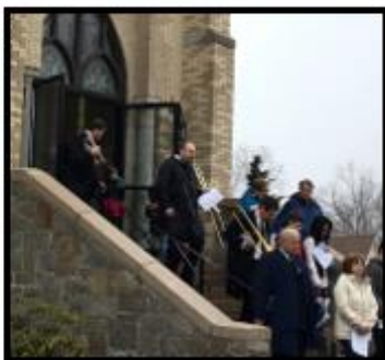
Brass and Pilgrims leaving Emanuel Lutheran at the Good Friday Way of the Cross.