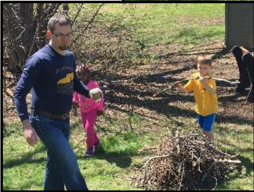
More Cleanup from Scout Sunday.