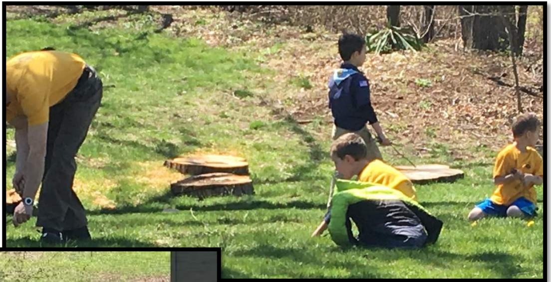
Cub Scouts and their parents help to clean up the South Lawn of Concordia on Scout Sunday.