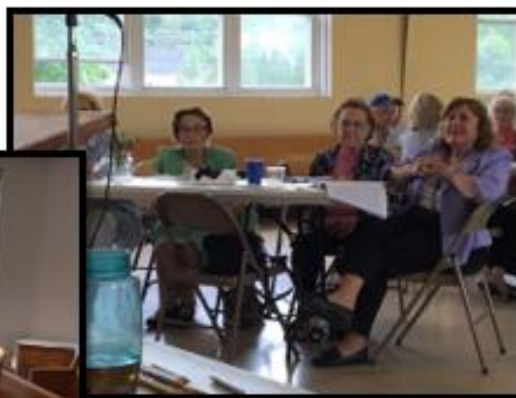
Concordia's June Semi Annual Meeting