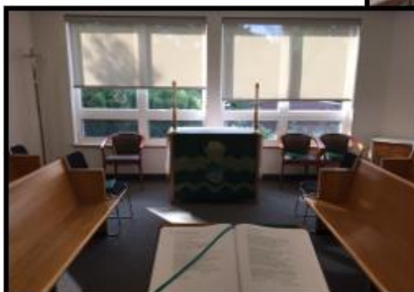
Summer Worship Space