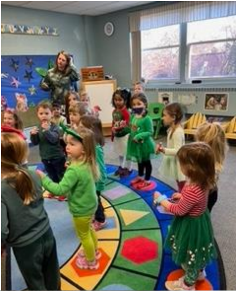
Lots of Advent activities at Concordia Nursery School!