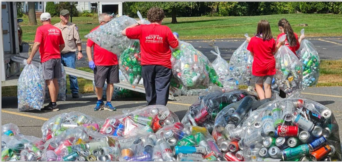
Troop 123 Can and Bottle Drive, September 14, 2024